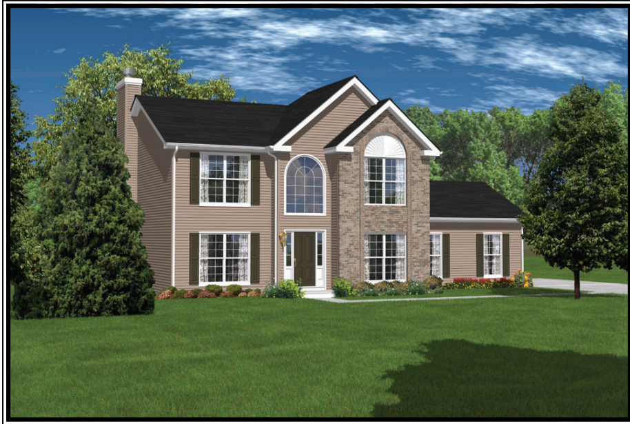
Elevation A – with optional brick.