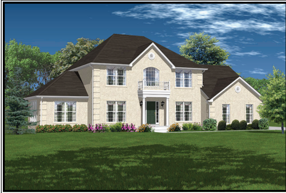
Elevation A – with optional stucco & portico.